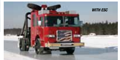
Master Low-Traction Situations with 4x4 Saber's optional 4-wheel drive system is built to get you quickly across slippery surfaces and over rough terrain.