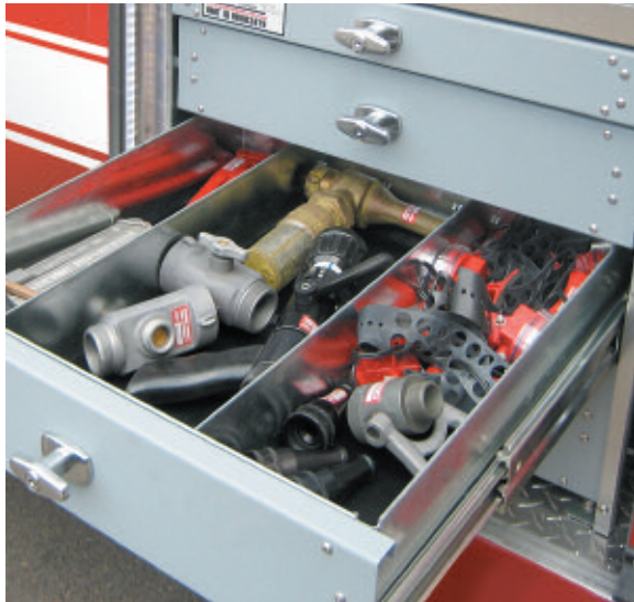
The simple solution to an organized compartment on your fire apparatus.